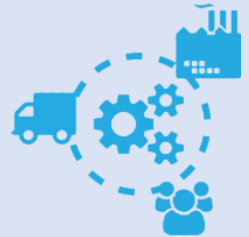
Manufacturing and Production

Information contained in this infographic comes from a survey conducted by NAEPB. Fifty-seven member nonprofit agencies participating in the AbilityOne Program responded providing data for fiscal year 2021.